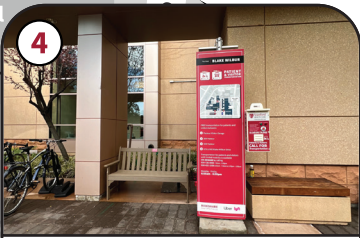
4 Blake Wilbur Outside of 875 Blake Wilbur Drive, near bicycle parking