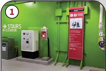
1 Pasteur Visitor Garage Level 1 (green) lobby inside the Pasteur Visitor Garage.