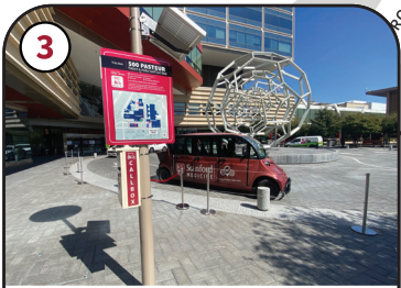
3 500 Pasteur Outside of the Transportation Lounge & Gift Shop