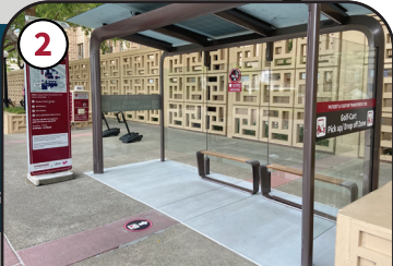
2 300 Pasteur On North Pasteur Drive, next to the fountain.